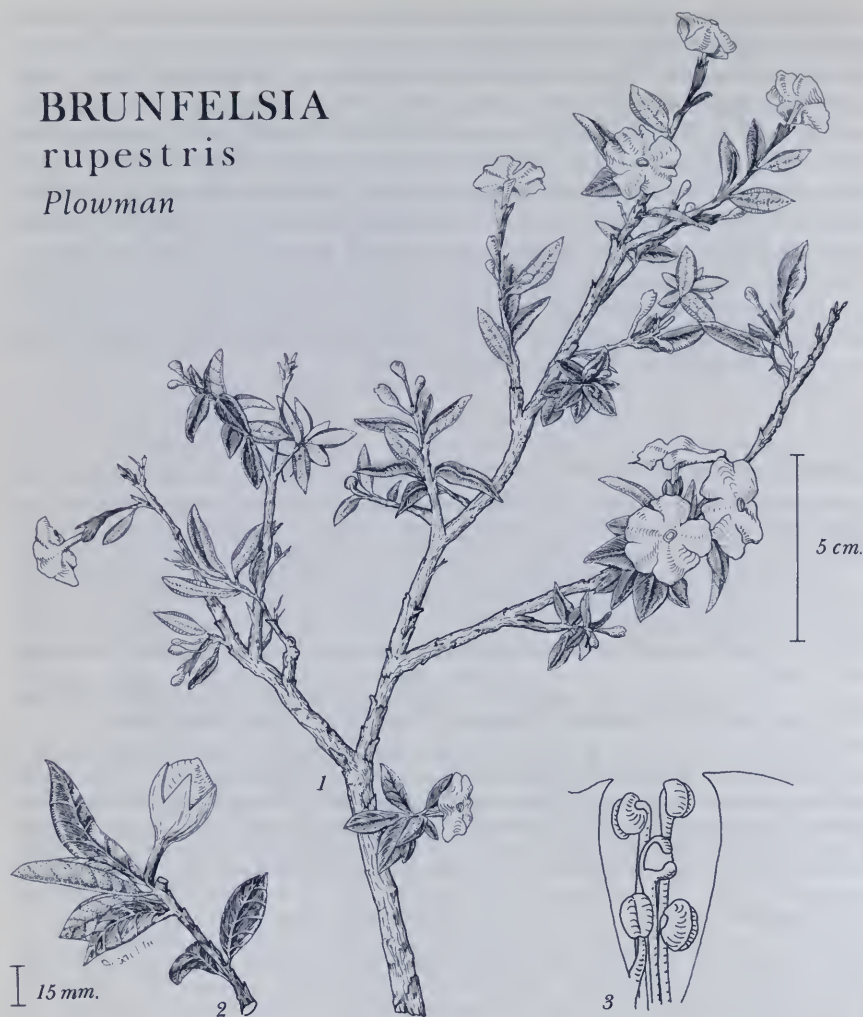
FIG. 3. Brunfelsia rupestris Plowman. 1, flowering branch; 2, fruiting branch; 3, excised apical portion of corolla tube showing anthers and stigma. (1 and 3 drawn from Shepherd et al. 3935, 2 from Ferreyra 887.)

Etymology .—From Latin rupestris , "rock-dwelling, of rocks," referring to the habitat preference of the species for rocky outcrop areas.